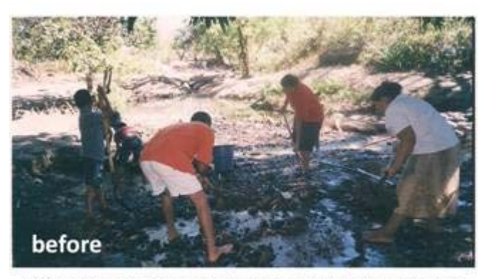
Sisters, brothers and people and children of the community removing the mud of the well o spring

Example 2 of Seed Projects: Repair of spring of water. This project had a lot of impact in the community. This spring was destroyed in hurricane Mitch in the 1998. It was where the women were washing clothes,. Now they had to walk a lot to go to the next river to wash its clothes. The Church of the Moraicito received the training and God put in its heart to move the leaders of the church and to motivate to the same community to clean out the spring. Before the training the men weren't interested to solve this problem because it was a problem that affected the women. This was true even inside the church. After the training God changed their hearts and they worked with the community to repair the spring. Now the women are very grateful to see the love of God in the church. Until this happened the women had to walk to the river for more than ten years. This project was of a lot of impact for the community.