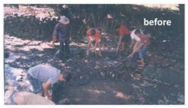
Sisters, brothers and people and children of the community removing the mud of the well o spring